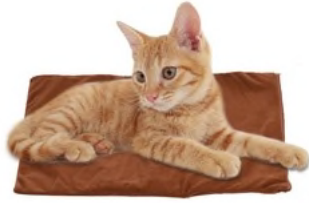
SAFE Low Voltage Outdoor Heating Pad | Free Shipping