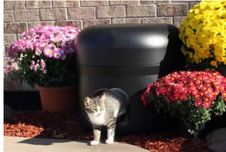
The Kitty Tube The Kitty Tube Generation 3 – with Pet Pillow | Free Shipping